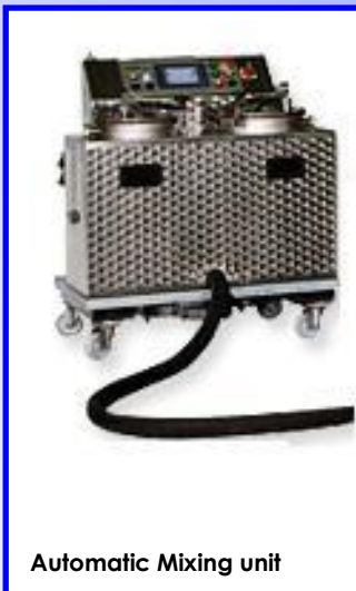
Automatic Mixing unit